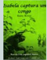
Isabela captura un congo

If students need a replacement copy of their chosen book or if they would like additional titles, they may be ordered from www.fluencymatters.com .