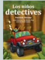
Los niños detectives

If students need a replacement copy of their chosen book or if they would like additional titles, they may be ordered from www.fluencymatters.com .