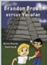
Brandon Brown versus Yucatán

Returning students entering Grade 7 are required to read ONE of these novels: