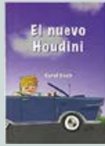
El nuevo Houdini