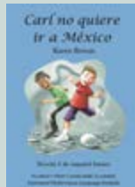
Carl no quiere ir a México