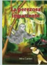
La perezosa impaciente