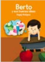
Berto y sus buenas ideas

Returning students entering Grade 6 are required to read ONE of these novels: